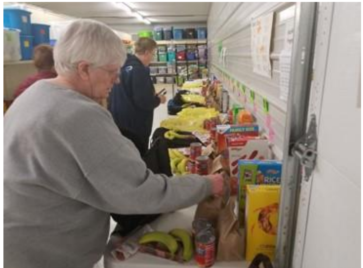
Zion Backpack Packing