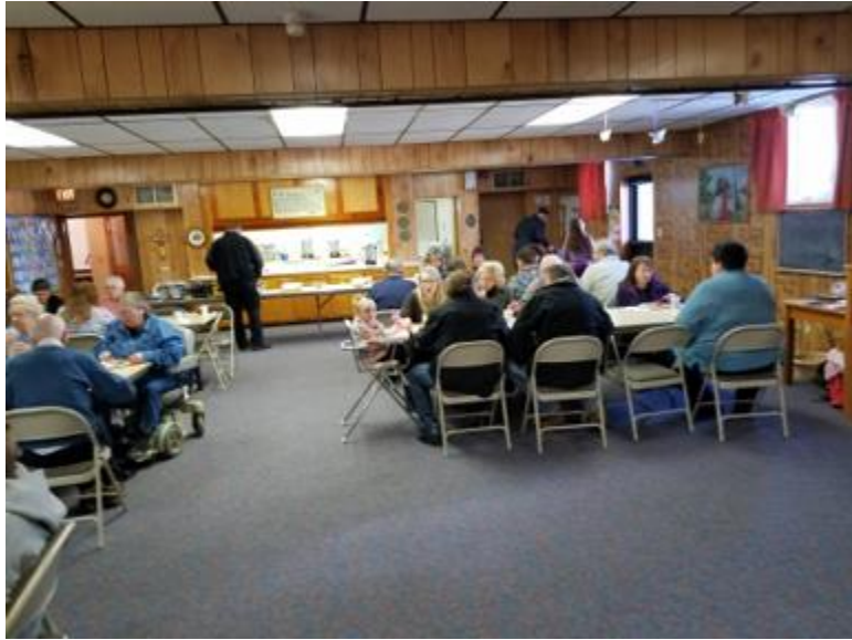
Zion Annual Mtg-Feb. 4