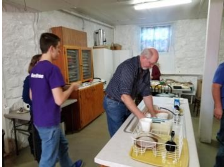
Peace Soup Supper- Feb. 7