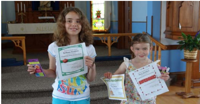
Peace SS award's day