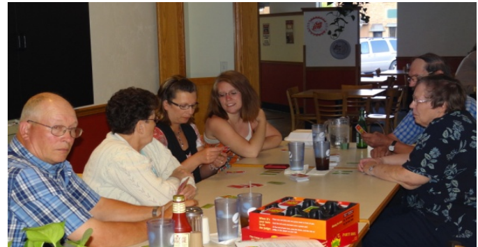
Friend's Night out at Amico's