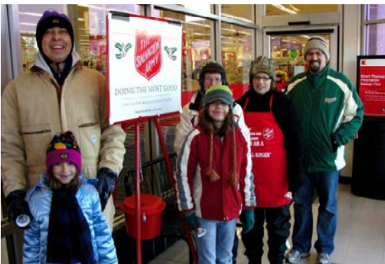
Ringing Bells for Salvation Army in Shawano