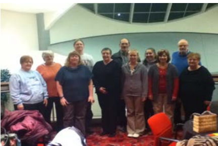
Attending the Danu Concert in Appleton