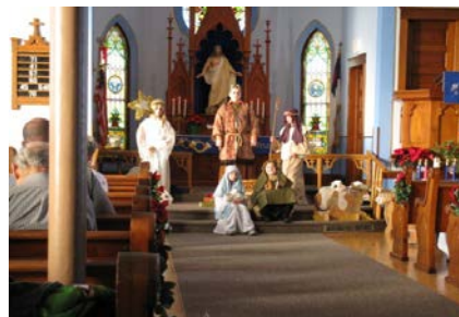
Christmas Program at Zion & Peace