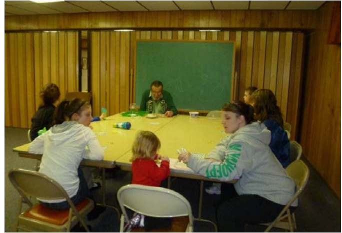
Parent's Night Out- January 14