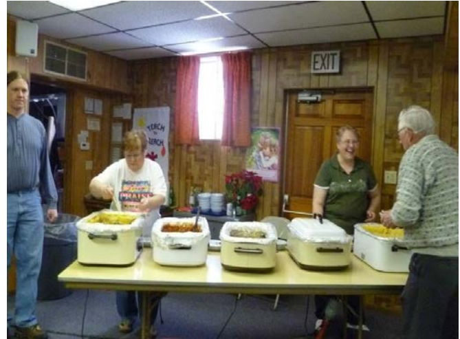
Zion Choir Soup Dinner- January 22