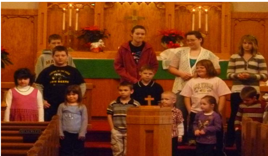
Zion Sunday School Singing- January 22