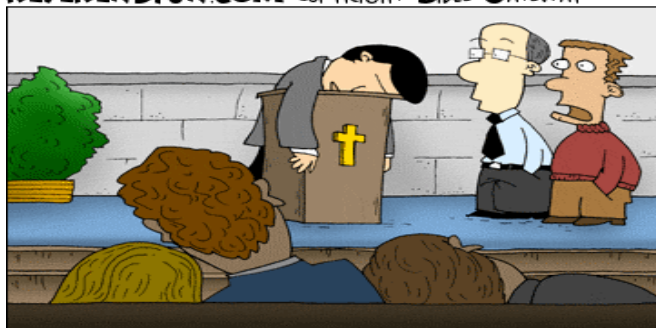
HE SEEMS TO HAVE LOST HIS ZING