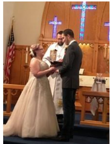
Malueg Wedding- June 16