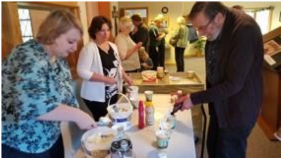
Father's Day Fellowship