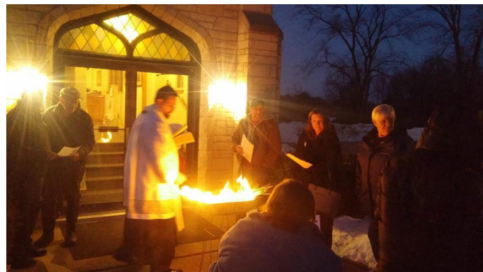
Burning of palms for Ash Wednesday-Feb. 13

-Sermon on Mark 16:1-8, delivered in 1538