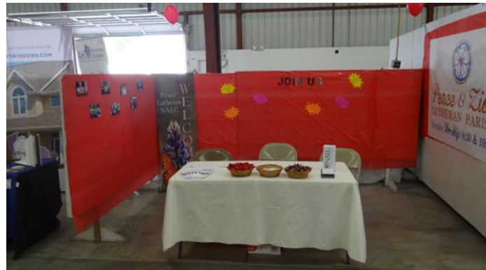
Shawano Co. Fair Booth