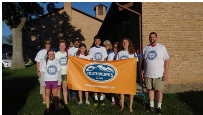
South Dakota Mission Trip Group