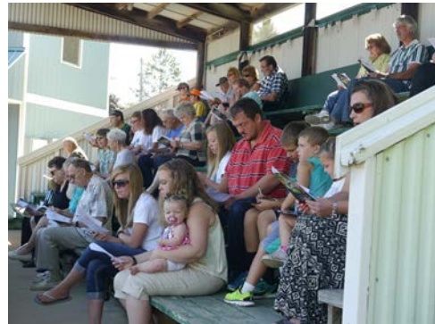
Joint Outdoor Service- Aug. 14