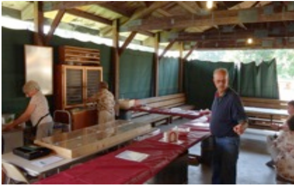
Peace Pie Stand-Lumberjack Days