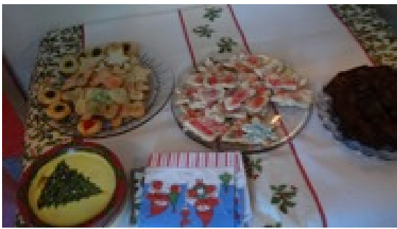
Christmas in July