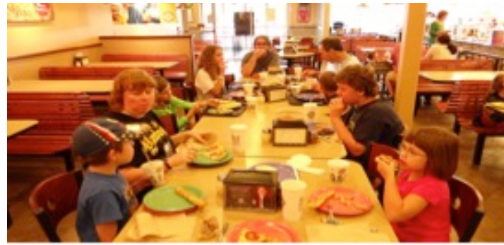
SS Trip to FunSet Avenue