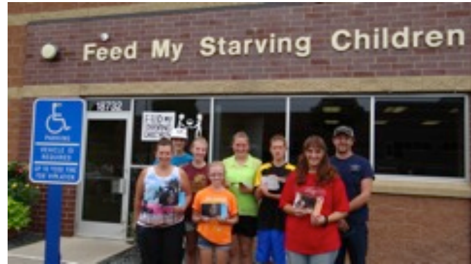
Youth Service Trip to Minnesota