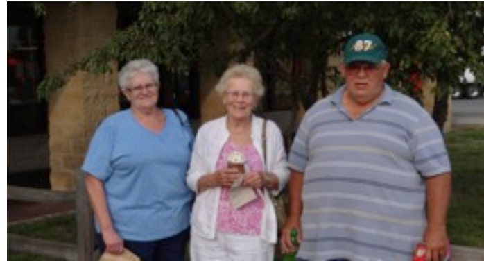
NALC Convocation- Aug 8-9