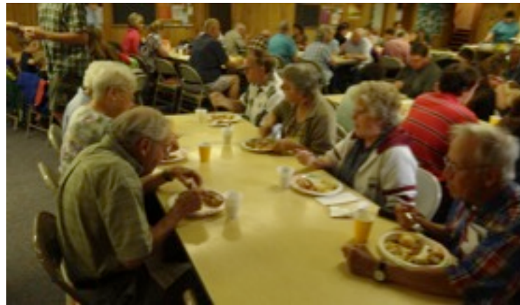
Joint Outdoor Service- July 21