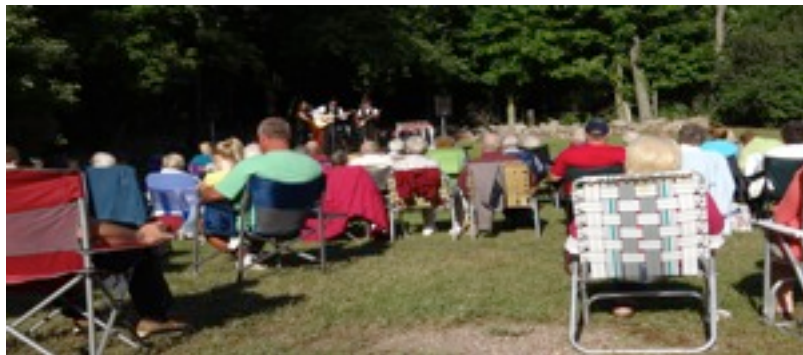
Blue Ribbon School House Concert- Aug. 3