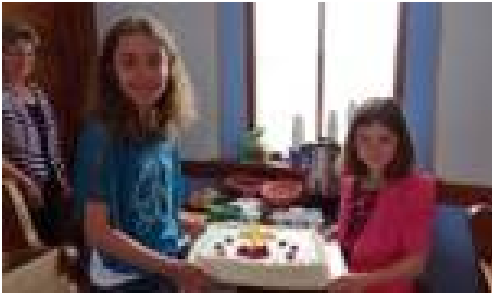
Peace last day of SS