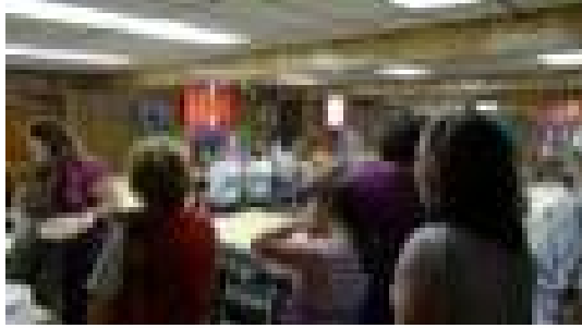
Zion Last Day of SS Picnic and Activities