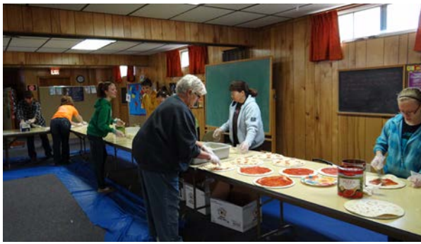
Zion Youth Pizza Fundraiser