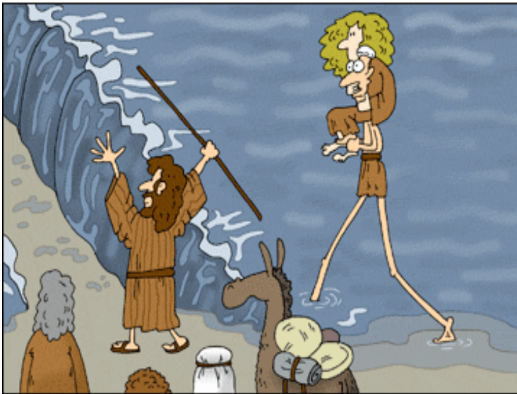
(See Exodus 14) 06-13-2011

WITH THE SEA NOW PARTED, OL' LEGGY MCFURGUSON KNEW HE HAD MISSED HIS ONE CHANCE TO BE THE HERO AND TO GET THE GIRL