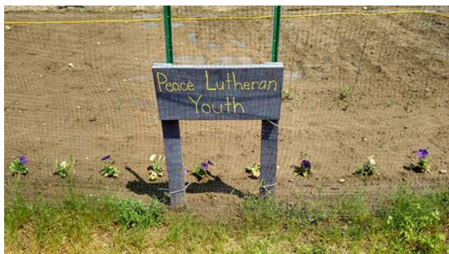
Look for lots of good things from the Peace Youth Garden plot!

(Who can tell me what this is referencing?-PC)