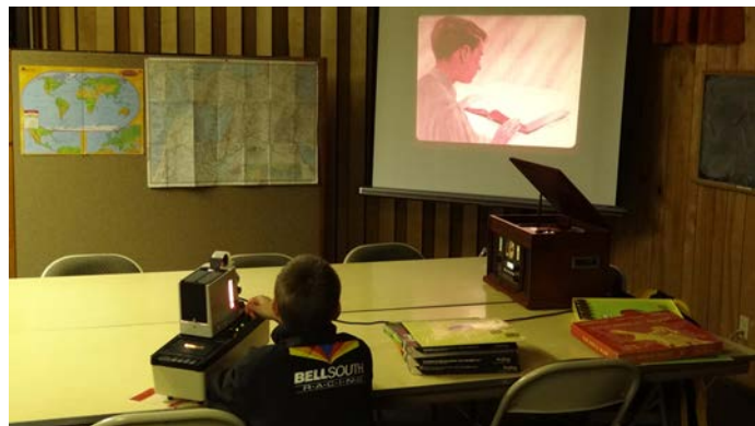
Watching old church filmstrips