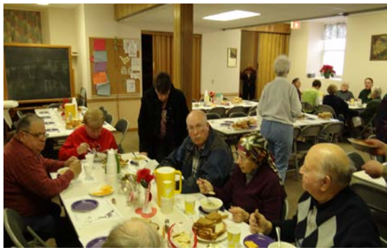
Peace Soup Supper