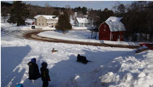
Youth Sledding Party