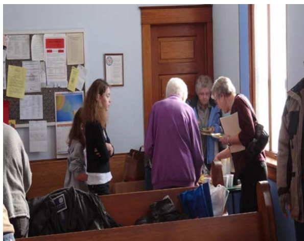
Peace Fellowship in February