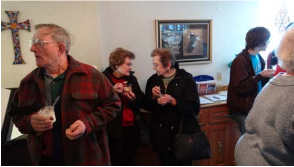
Super Sundae at Zion