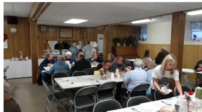
Peace Soup Supper