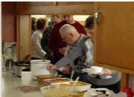
Peace Annual Meeting