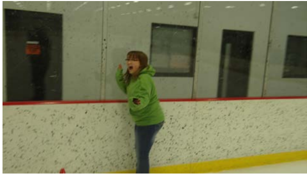
Youth Ice Skating -Jan. 25