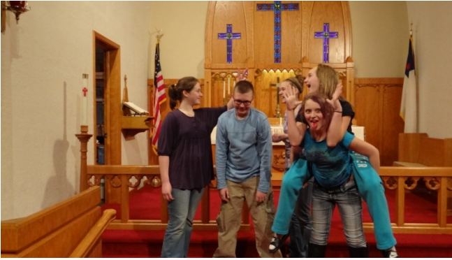
A typical Confirmation Class on Wednesday's