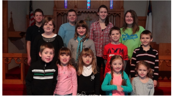
Zion Sunday School Directory Picture

As I am sitting in my hotel room in Fort Wayne, IN I am writing this newsletter article, I just spent my day sitting in a lecture hall, listening to six, hour-long papers being presented (which was wonderful I might add). The overall theme of the symposia this year was morals and ethics as it relates to marriage and the family. A variety of topics were presented, with a general focus on the Biblical understanding of marriage and the place of children in the family and church.